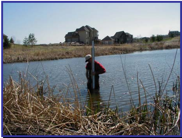
Scientists routinely gather data and conduct research on the Vermillion River and its tributaries. The grant will enhance the already-extensive monitoring network to help identify the critical functions of the watershed that exist in different locations.

The Vermillion River Watershed Joint Powers Organization (VRWJPO) will use the Targeted Watersheds Grant funds to address the flow volume and thermal loading issues in the watershed. They will accomplish this by: