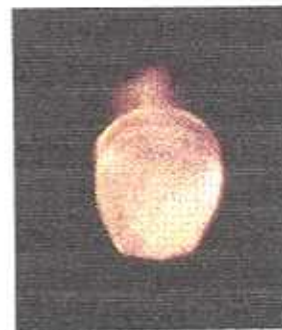
L. higginsii juvenile.

Juvenile: Excysted form, having dropped from the host fish and actively pedal feeding with foot movement.