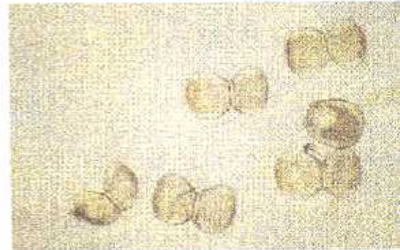
L. higginsii glochidia.

Glochidia: Larval form flushed from the marsupial gill of the female mussel.