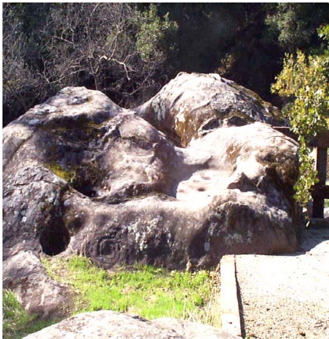
Figure 3. Indian mortars and a spiral petroglyph carved into an outcrop of Temblor Sandstone.