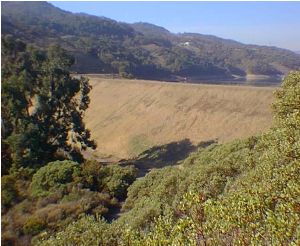
Figure 11. Chesbro Reservoir Dam with a Pajaro Manzanita grove in the foreground.