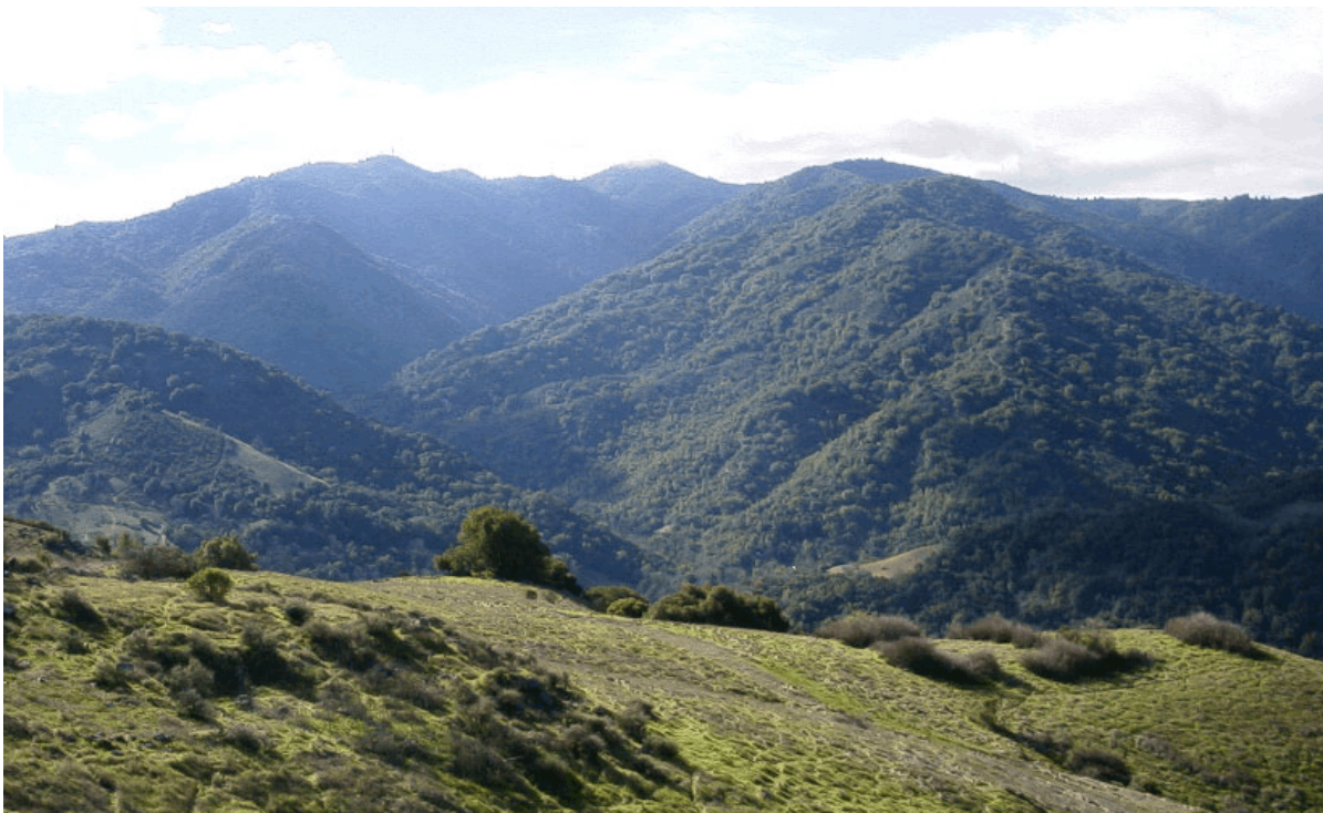
Figure 17. Loma Prieta peak “kissed by clouds” (view facing south from Mine Hill).