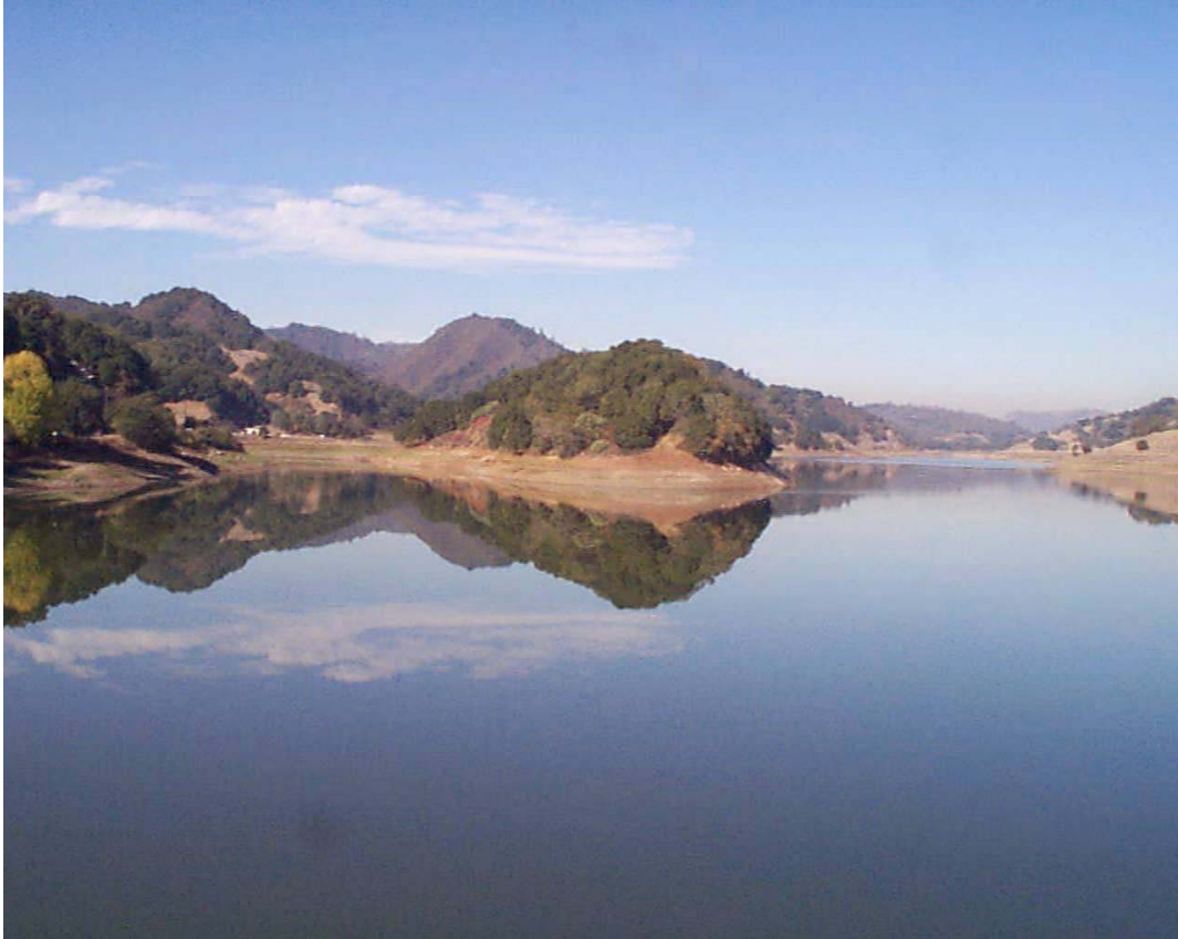
Figure 7. Uvas Reservoir fills the valleys of Carnadero Creek (left) and the “straight valley” of Uvas Creek (right). Stream capture diverted Carnadero Creek to a new route beyond the ridge now surrounded by reservoir.