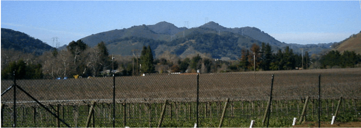
Figure 5. View of Twin Peaks ridge looking northwest near the intersection of Day Road and Watsonville Road. The valley to the left is that of Uvas Creek. Watsonville Road continues across the divide on the right through an abandoned stream valley (Hayes Valley) and later follows the stream valley of Llagas Creek (Paradise Valley).