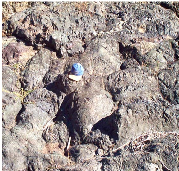
Figure 9. Pillow basalt.