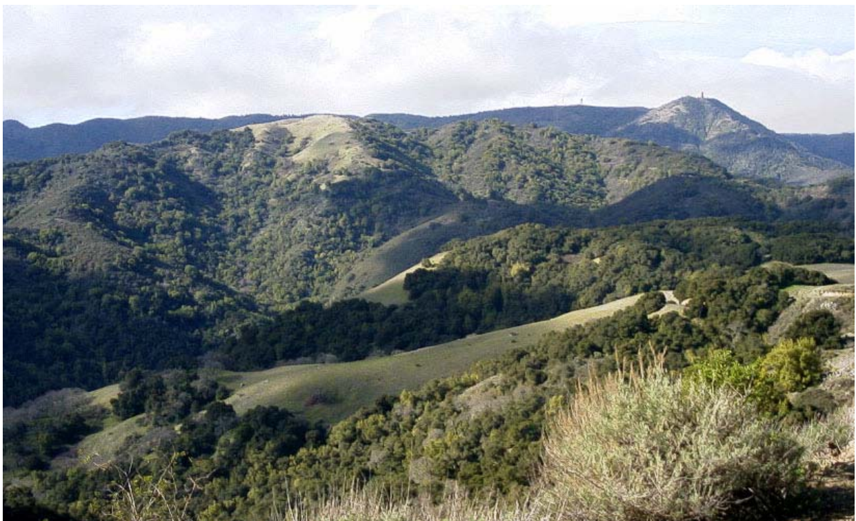
Figure 15. The grassy top of Bald Mountain stands out in front of the Sierra Azul Ridge. Mt. Umunhum is on the right. The picture was taken from the top of Mine Hill facing south.