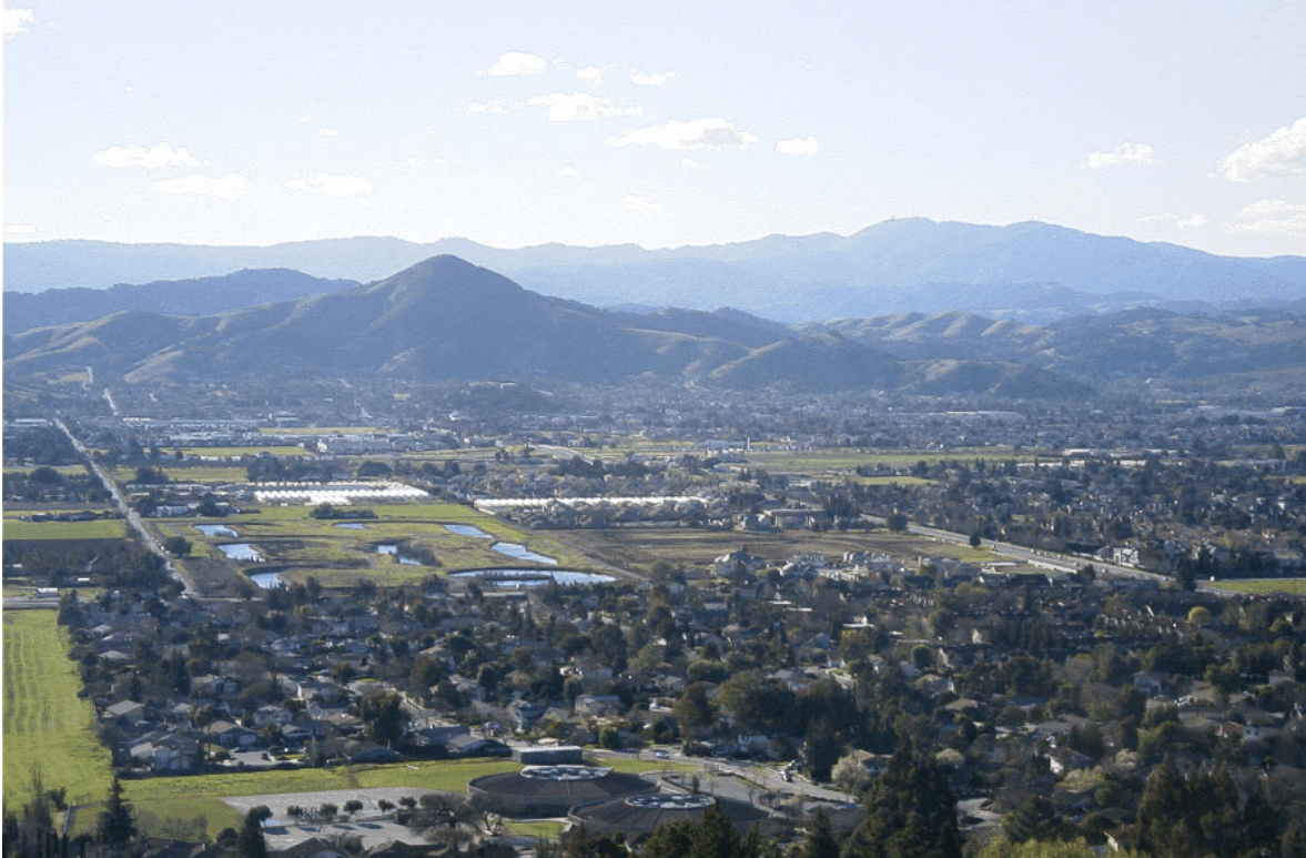
Figure 2. El Toro rises above Morgan Hill in the Santa Clara Valley. The dark ridge behind to the left of El Toro is the ridge of Twin Peaks. the distant crest of the Santa Cruz Mountains includes the Sierra Azul Ridge, with high points Loma Prieta (on left) and Mt. Umunhum (on right).