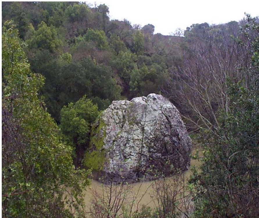
Figure 21. A large block of graywacke sandstone rises from the south end of Guadalupe Reservoir.