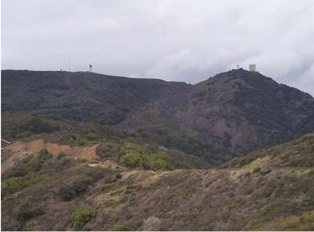
Figure 16. Mt. Umunhum (with the blockhouse on top) displays steep, rocky serpentinite cliffs on its eastern face.