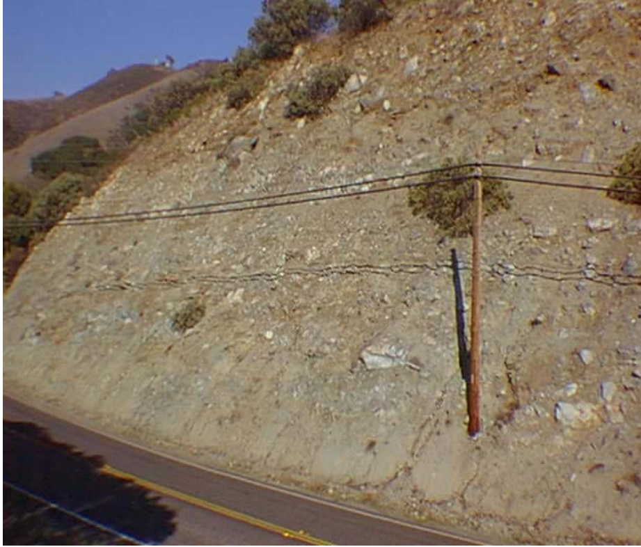
Figure 12. Serpentinite outcrop near Chesbro Reservoir Dam.