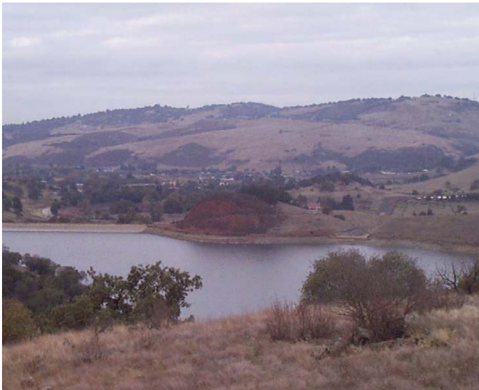
Figure 13. Calero Reservoir and dam as viewed from the western hillsides. The Santa Teresa Hills are in the distance (east).