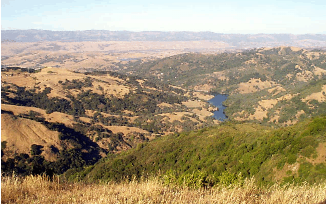
Figure 20. Almaden Reservoir highlights the Alamitos Creek Valley. Mine Hill is on the left. In the distance across the valley are the grass-covered Yerba Buena Ridge and the forested Diablo Range. This east facing view is from the overlook on Bald Mountain.