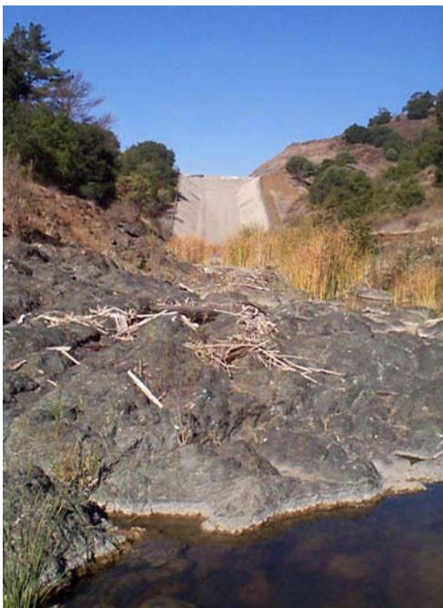
Figure 8. Outcrops below Uvas Dam spillway.