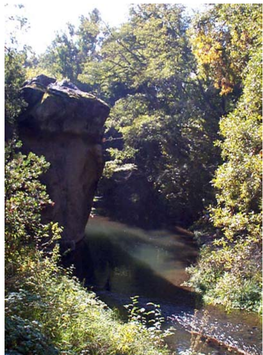
Figure 4. Outcrop along Uvas Creek.