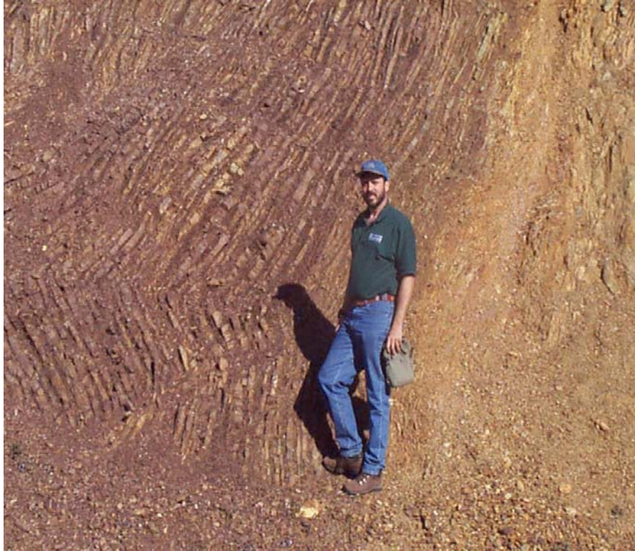
Figure 14. Ribbon chert layers exposed along Mt. Umunhum Road on Bald Mountain.