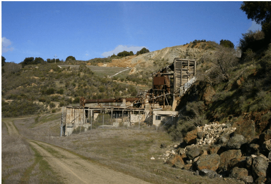
Figure 19. The Cristobal Mine of the New Almaden Mining District on top of Mine Hill.