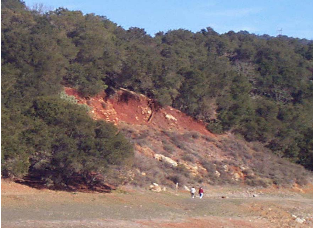
Figure 10. Limestone outcrops with terra rossa (red soil) along the shore of Uvas Reservoir near the boat dock parking area.