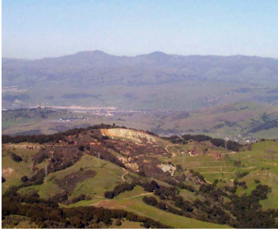
Figure 18. Eastward facing view from Bald Mountain of Mine Hill (Cristobal Mine area) displaying scars of cinnabar mining. The Santa Clara Valley and Mt. Hamilton in the Diablo Range in the distance.