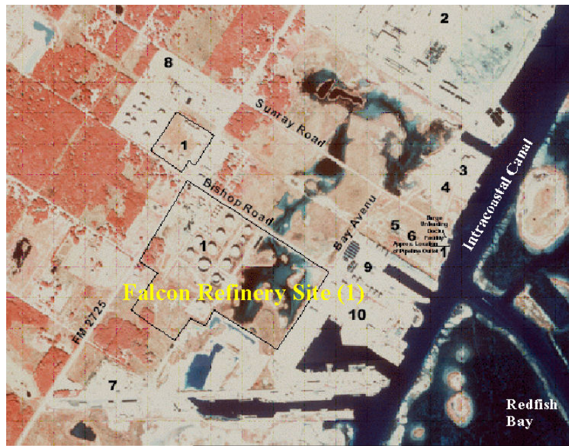
Falcon Refinery aka National Oil Recovery Corporation Ingleside, San Patricio County, Texas TXD 086 278 058