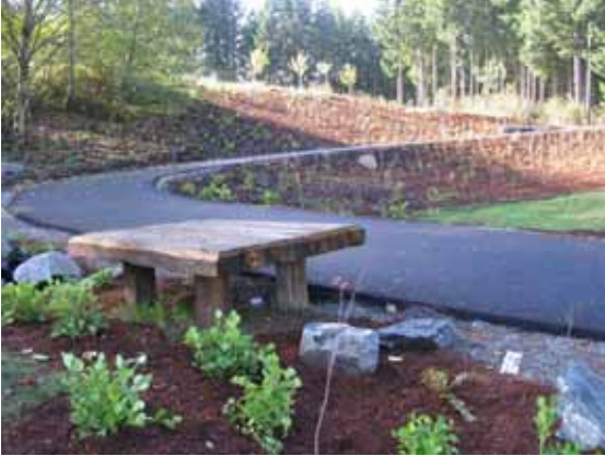
Fully constructed Nisqually Pathway (completed in November 2005).