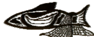
Nisqually Logo

TRPC has set aside an allocation of their Federal Surface Transportation Program (STP) funds called the Rural Community Support Program (RCSP) for the tribes and smaller rural communities, who will have the opportunity to apply for those funds without competing against the larger jurisdictions with more grant-writing staff resources. Thurston County recently used RCSP funds awarded to the Nisqually Tribe to pave a segment of road on the reservation that was in poor condition, at considerable cost savings to the Tribe. A ground-breaking agreement between the county and the Tribe enabled this cooperative venture between governments.