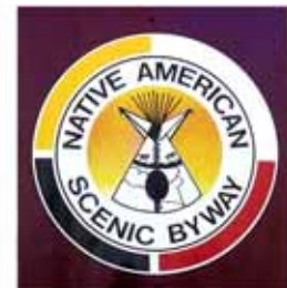
Logo used for signage along the Native American Scenic Byway

The Lower Brule Sioux Tribe approached the SDDOT with the idea of developing a Native American Scenic Byway to follow the Missouri River. The proposed route included a 41-mile section of SD 1806 and 7 miles of BIA Highway 5, both of which needed improvements before the corridor could be designated. A coordinated effort was launched among the SDDOT, Lower Brule Sioux Tribe, Crow Creek Sioux Tribe, BIA, FHWA, and US Army Corps of Engineers to try and improve the roadways and to develop the first Native American Scenic Byway corridor. SDDOT received $8.5 million of Public Lands Highways (PLH) discretionary grant funds, which were combined with state funds and IRR funds to grade and asphalt surface both roads.