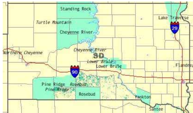
Location of Tribal Lands in South Dakota

Though tribal members are involved in MPO planning processes, coordination on improvements to state highways located on tribal lands are captured through the statewide planning process.