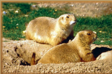
black-tailed prairie dogs Cynomys ludovicianus

Grasslands once dominated central North America, but have undergone radical and rapid changes in the past century. The PRAIRIEMAP project was developed in response to growing concern among scientists and resource managers over significant declines in grassland ecosystems and the wildlife species that depend on them for their survival, also known as obligate species.