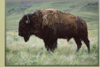
American bison Bison bison