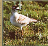
Above: mountain plover Charadrius montanus Right: burrowing owl Athene cucularia