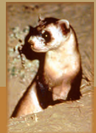
Grassland-obligate species, such as the black-footed ferret ( Mustela nigripes ) have been nearly extirpated due to loss of native grasslands.

As a result of this habitat loss, which has been associated with factors including agricultural development, overgrazing of livestock, oil and gas exploration, and