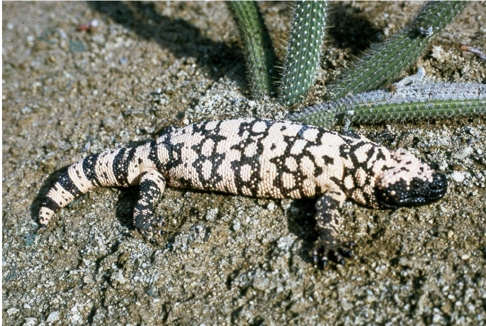
Fig. 3. Same Gila monster in Figure 3 photographed while at the Los Angeles Zoo.

desert at that time, and the fact that the specimen was diagnostic of the geographically expected race, H. suspectum cinctum . Figures 2 and 3 clearly show the banded pattern typical of this subspecies. De Lisle (1986) indicated that specimens from the Providence Mountains were mostly pink with a reduction in black pigmentation relative to other H. suspectum .