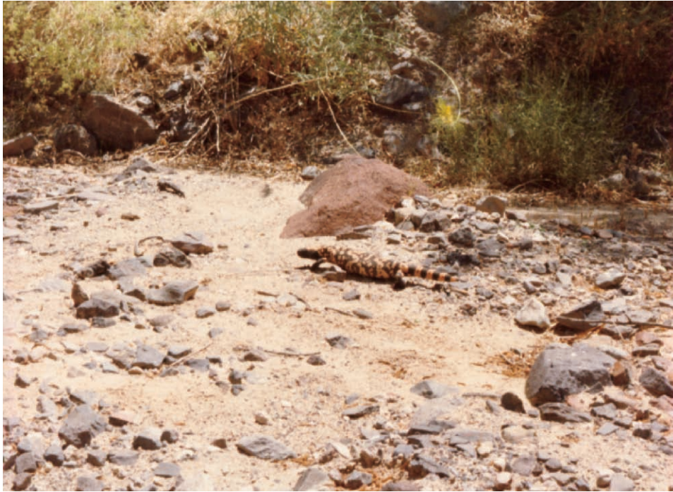
Fig. 5. The Gila monster from Piute Springs (Fort Piute), San Bernardino County, California. Photo by Earl Curran. LACMPC #1364a.

tons are part of a chain of sky islands with elevations exceeding 2,200 m. The first specimen was sighted, and photographed (Figures 6 and 7), 5.5 km east-northeast of Horse Thief Springs (elevation 945 m) on 4 May, 1980, and is the only documented Gila monster from Inyo County. The second was sighted 1.4 km west of Porcupine Tanks at 1,220 m on 20 May, 1980. The third was seen 2.6 km west of Kingston Peak at 1,130 m on 3 June, 1980. All three occurred in sandy washes associated with large boulders. Plant species in the area included catclaw acacia ( Acacia greggii ), burrobush ( Ambrosia dumosa ), Death Valley ephedra ( Ephedra funerea ), creosote bush ( Larrea tridentata ), and desert almond ( Prunus fasciculata ) (Ford 1981).