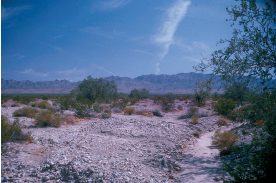
Fig. 1. Ironwood wash woodland near Palen Pass, Riverside County, California. Granite Mountains are in the background.

hillslopes (Figure 1). The Chuckwalla Valley ranges from 200–350 m at the base of the Granite Mountains.