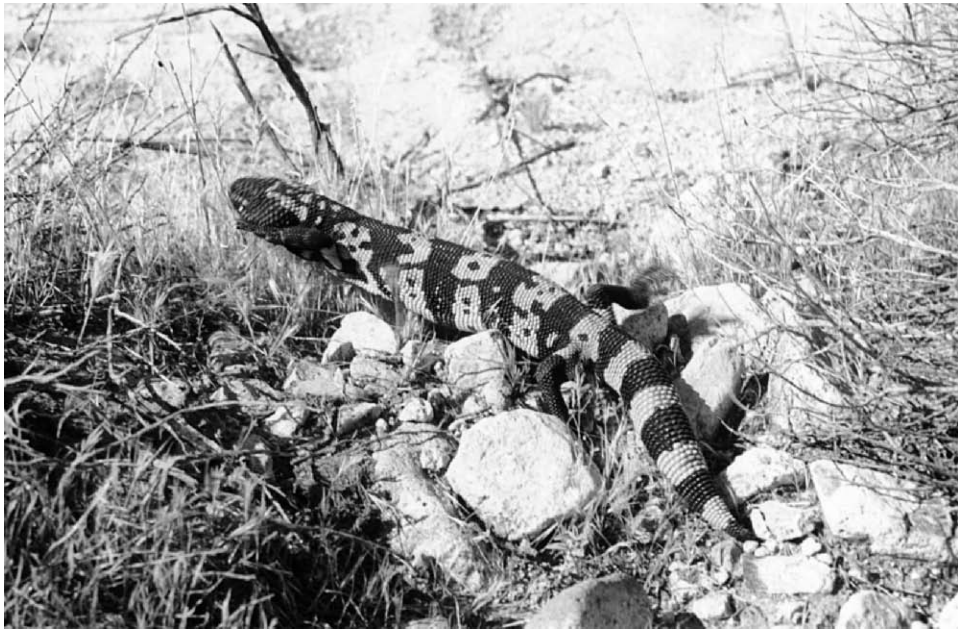
Fig. 6. Gila monster from the Kingston Range, San Bernardino County, California, 1.4 km west Porcupine Flats. Photo by Randall Ford, 30 May, 1980. LACMPC #1329.

Clark Mountain. —At almost 2,400 m, Clark Mountain is the highest of the east Mojave sky island mountain ranges in California. Bradley and Deacon (1966) reported a specimen collected from the eastern slope of the Clark Mountains in 1962 now in the collection of the Marjorie Barrick Museum of Natural History at the University of Nevada, Las Vegas (#R 665, Figure 9). The snout-vent length of the specimen is 267 mm with a total length of 40.5 cm. This collection site is about 11 km southwest of the California-Nevada state line. Several other specimens were reported from nearby Clark County, Nevada, and all were collected at elevations below 1219 m (Bradley and Deacon 1966).