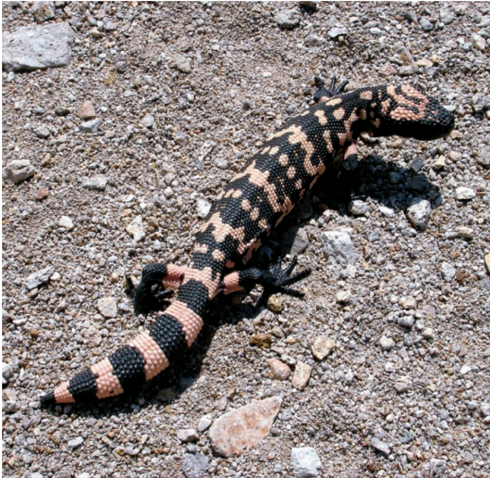
Fig. 8. Gila monster from the Kingston Range, San Bernardino County, California. Details of the sighting will be reported elsewhere. Photo by R. Terry Basey, 22 May, 2006. LACMPC #1439.

been reported from California. Although many are unverified or unsubstantiated by photographs or voucher specimens, they are listed here to stimulate additional searches for this elusive species. Some of the records of Gila monsters in California are undoubtedly for released captives, like the two specimens listed from urban Contra Costa County by Bury and Luckenbach (1976), an area well outside of the natural historic range of the species. However, translocated specimens have turned up in remote portions of the California desert as well. According to Brown (1976), a specimen was reported from the OX Ranch, Lanfair Valley, San Bernardino County in June, 1975. Apparently, the animal was a captive brought from Arizona by a ranch hand. That specimen is now housed at Museum of Vertebrate Zoology, U.C. Berkeley (MVZ 128983), after reportedly being won in a card game by California herpetologist Roger Luckenbach (Harry Greene, in litt. ).