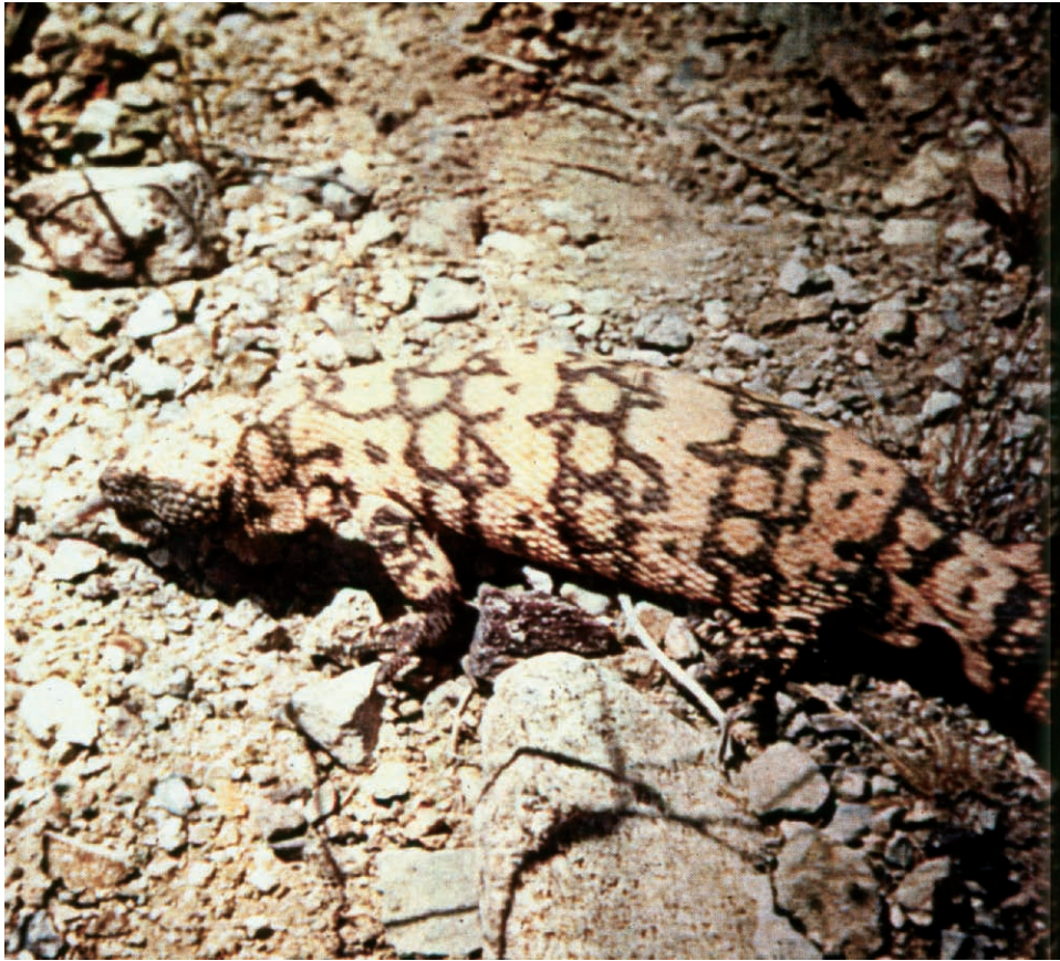
Fig. 2. The Gila monster from the Providence Mountains, Vulcan Mine Road, 16 April, 1968, 1000 hr. Photo is catalogued as Los Angeles County Museum Photographic Catalog (LACMPC) #1331.

is not the westernmost record of Gila monsters from this area (Funk, 1966). Due to the meandering course of the Colorado River, specimens from near Yuma, Arizona were found about 14.5 km west of the California record above.