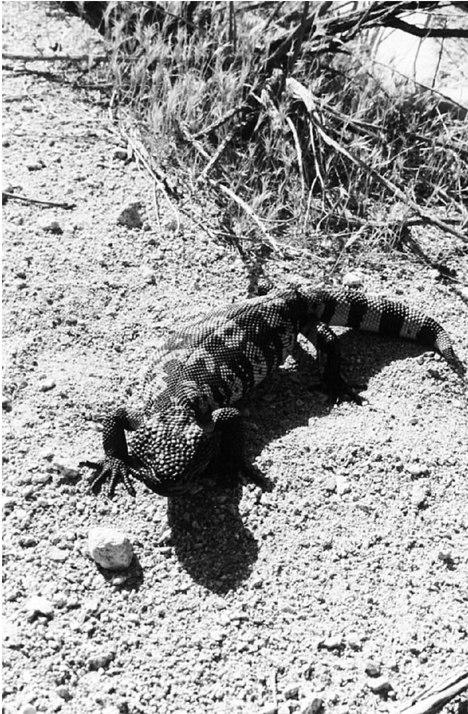
Fig. 7. Gila monster from the Kingston Range, San Bernardino County, California, 1.4 km west Porcupine Flats. 30 May, 1980. LACMPC #1330.