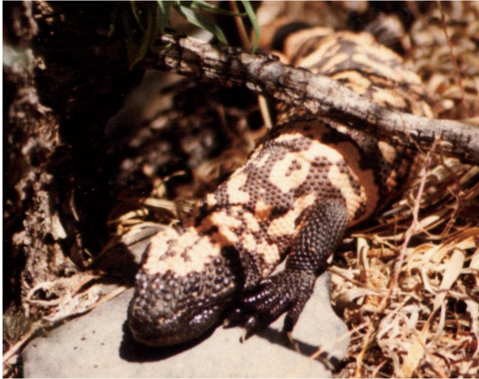
Fig. 4. The Gila monster from Piute Springs (see caption of Figure 3) in riparian streambed. LACMPC #1364c.

litt. ). When observed, it was in a streambed among vegetation and surface litter. The temperature at the time was 18.3° C under sunny, mostly clear skies with winds of 8–16 kph. It had rained “several” days prior to the observation. The elevation at the site is 853 m. Piute Creek is the only perennial stream for many kilometers around and is characterized by typical desert riparian plant species including Salix sp., Baccharis viminea , Prosopis sp., and Tamarix ramosissima . A subsequent herpetological survey of the site did not detect Gila monsters (Hazard and Rotenberry 1996).