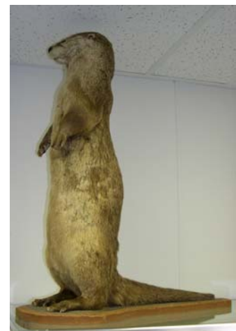
Figure 1. A mounted River Otter at Marais des Cygnes National Wildlife Refuge

Table 1 lists the results of the USFWS-wide inventory of museum property categories as of 2006. Most of these objects and documents are being held in museums and educational institutions. But, some museum property is held at the National Wildlife Refuges for exhibits and interpretation (figure 1).