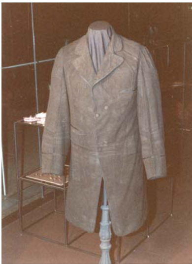
Figure 4. Men's frock recovered from the Steamboat Bertrand

The USFWS has also established facilities to help maintain museum property on a national basis. The D.C. Booth Historic Fish Hatchery in South Dakota is part of an active effort to preserve the heritage of the Service. Climate-controlled storage is devoted to the preservation of documents and collections related to the history of fish culture.