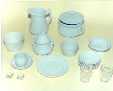
Figure 3. China service recovered from the Steamboat Bertrand.

The following year, over 200,000 artifacts were excavated from the wreck and its cargo (figures 2, 3, and 4). The Bertrand Collection is now exhibited at the refuge providing the visitor with a view into our nation's past and its impacts on wildlife and the environment.