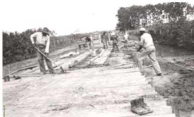
Figure 5. Historic photograph of CCC workers at White River NWR, 1936-1941

To document USFWS efforts to preserve our natural heritage, the National Conservation Training Center maintains exhibits on the history of the agency, the Department of Interior, and important events and people in conservation. For example, figure 5 shows CCC workers on White River NWR. The CCC was very important to the development of many Refuges.