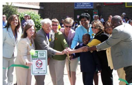
Partners join together for a ribbon-cutting ceremony at Clay Elementary School, opening the first "No Idling Zone" at a public school in St. Louis.