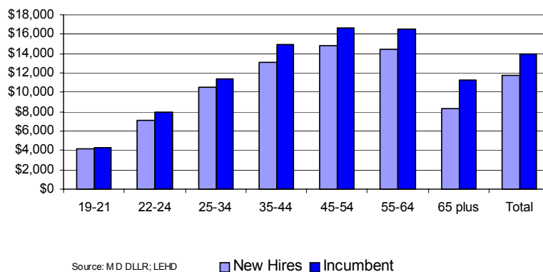
Quarterly Earnings in Research Services