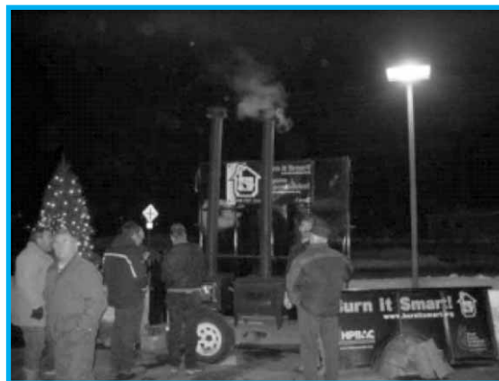
Participants view the demonstration at the burn trailer showing proper use of woodstoves.