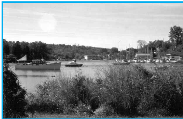
Picton Harbour is in the Bay of Quinte Area of Concern.

Bay of Quinte: A number of the beneficial use impairments and restoration targets are currently being reassessed (e.g. fish tumours and other deformities and beach closings). Measurable delisting criteria for the fish and wildlife habitat and populations impairments have yet to be set. A wildlife strategy is being developed and will help in determining progress against these impairments. A fisheries habitat management plan is also being developed to protect existing high-quality habitats from future development and restore degraded habitats. Fish community changes that have resulted from increased water clarity (reduced phosphorus and mussel invasions) are being studied. A monitoring strategy will be developed and recovery requirements will determine the timing of delisting. A phosphorous loading model, currently under development, will be the key to establishing phosphorous targets for the Bay. If studies indicate that phosphorous loadings can be managed and capped, management strategies are in place, and fish and wildlife habitat and population impairments are favourably assessed, recognition of this AOC as an "Area in Recovery" by 2007 could occur with concentrated efforts by agencies and adequate funding.