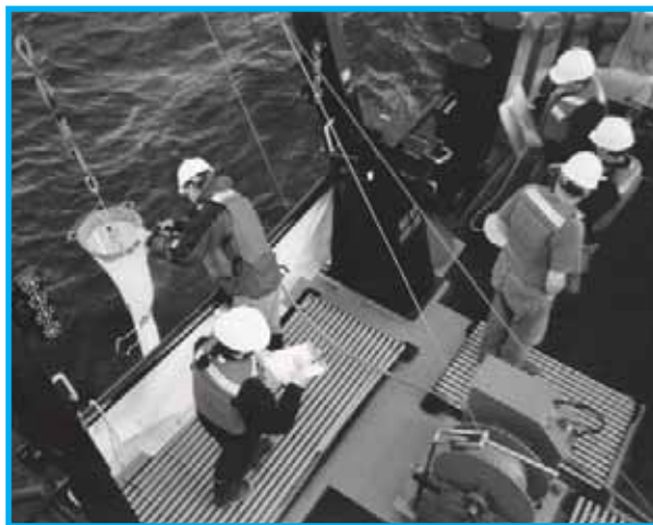
Monitoring activities from the deck of the Lake Guardian.

Samples containing PCBs, pesticides and PAHs were carefully prepared in the lab and split four ways, then analyzed by laboratories that perform analytical work for the Four Parties. The results are now being carefully reviewed to identify any data comparability issues. Later stages of this study will include the collection and analysis of actual field samples at Niagara-on-the-Lake.