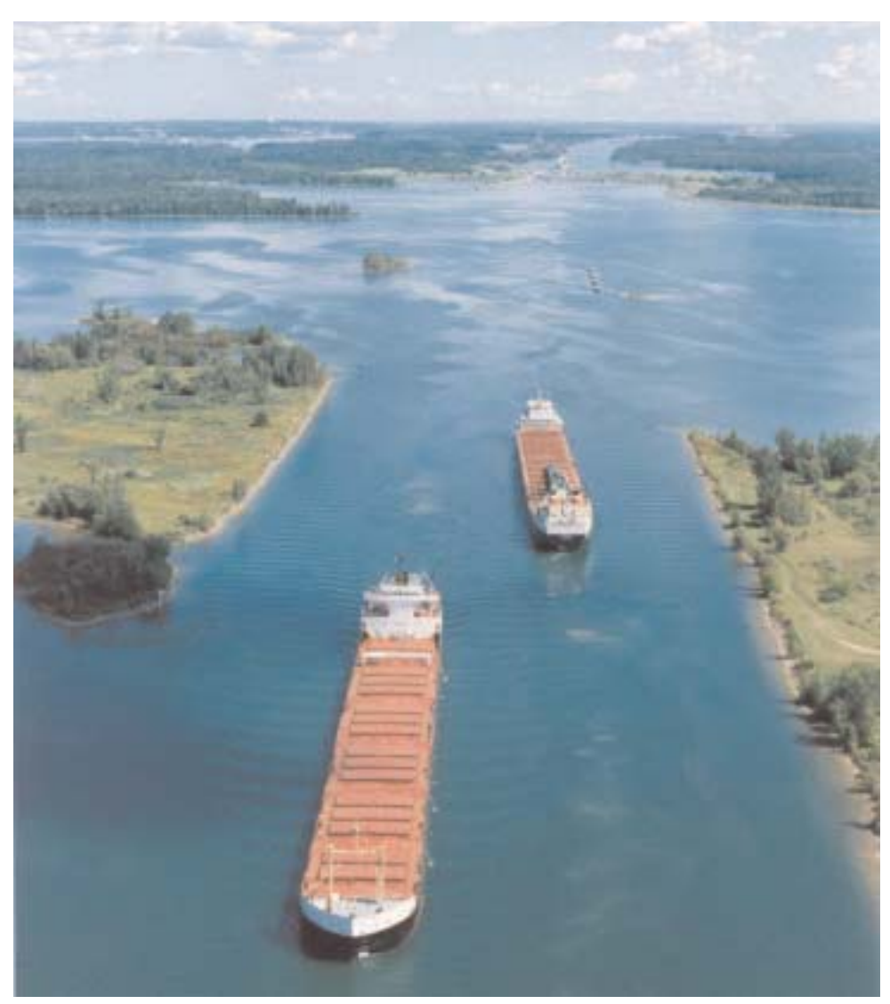
FY 2006 Budget In Brief