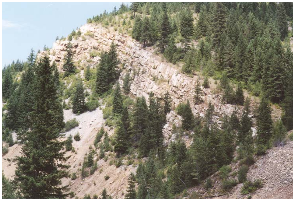
U.S. Geological Survey scientists recently completed an assessment of copper-silver deposits in the Revett Formation in northwestern Montana and northern Idaho. This photograph shows an outcrop of Revett Formation quartzite beds in the Coeur d'Alene Mining District of northern Idaho.

The Rock Creek-Montanore and Troy deposits, which are currently the most significant undeveloped resources identified in the western Montana copper belt, are among the Nation's largest stratabound copper-silver deposits, containing about 15 percent of the copper in such deposits in North America. Worldwide, stratabound copper-silver deposits contain 23 percent of all copper resources and are the second-most important global source of the metal after porphyry copper deposits.