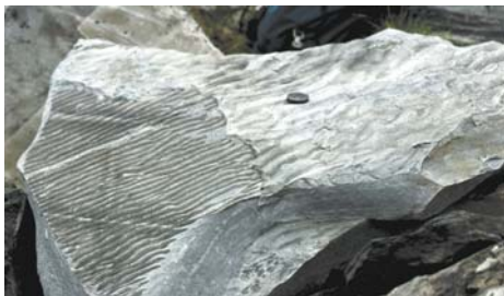
Rippled surface of a block of white quartzite from the Revett Formation. The thickest, cleanest quartzite beds in the formation were aquifers through which metal-bearing brines moved and became hosts for copper-silver deposits.

The western Montana copper belt, which extends from northwestern Montana into northern Idaho, contains several large stratabound (confined to a single stratigraphic unit) copper-silver deposits in fine- to medium-grained quartzites (metamorphosed quartz sandstone) of the Revett Formation. A recent U.S. Geological Survey (USGS) assessment indicates that a large area of U.S. Forest Service (USFS)-administered land in northwestern Montana and northern Idaho may contain significant undiscovered Revett-type copper-silver deposits.