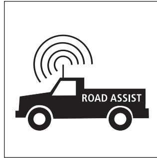
Mobilization and Response