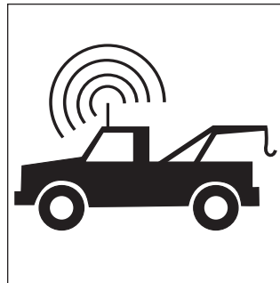
Clearance and Recovery