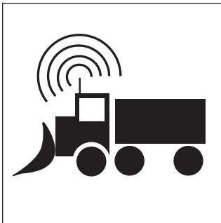
Response and Treatment