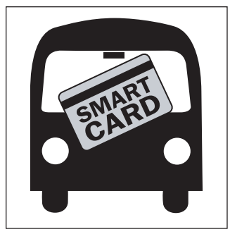
Transit Fare Payment