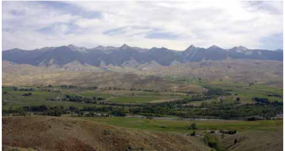
The Salmon River flows along the fault-bounded Lemhi Valley in the Salmon National Forest. Regional compilation of geologic mapping in digital formats by the U.S. Geological Survey supports U.S. Forest Service land-use planning for this region.

T he U.S. Forest Service is working to integrate geoscience information into land-use planning processes. To help achieve this goal, U.S. Geological Survey (USGS) Mineral Resource Program scientists are providing a wealth of information, including geologic maps, databases (geology, mineral locality, geochemical, and geophysical), and mineral assessments for the Northern Rocky Mountains of Idaho, Montana, and Washington. This area is known for its world-class deposits of gold, copper, silver, platinum, garnet, and talc and has been the site of a variety of mineral resource assessment studies by the USGS.