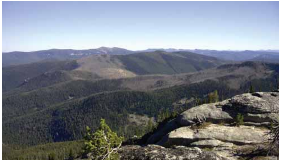
Burnt Knob in the Bitterroot Mountains of northeastern Idaho (foreground) and forest-fire scar along ridge crossed by the Nez Perce Trail. This area contains critical habitat for threatened and endangered species, such as grizzly bears, salmon, and bull trout, posing land-use management issues that are supported by new digital datasets from the U.S. Geological Survey.

Because the amount of technical information about the Northern Rocky Mountains was overwhelming, USGS scientists provided