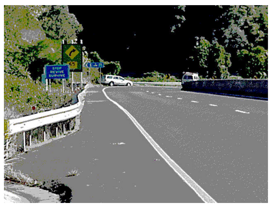
FIG 1: Selected Site

The selected site contains a right hand curve on a 4 lane section of the Princes Highway separated by a New Jersey kerb. Annual rainfall is in the order of 120 cm. There is an AADT in excess of 13000 vehicles per day. A curve warning sign is currently located in the approach to the curve with an advisory speed of 65 km/hr.