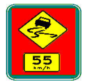
Wet Road - No Rain (Condition3)