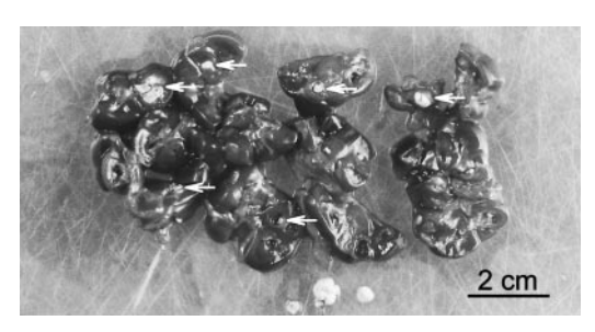
FIGURE 2. Left kidney of adult male river otter RAG-245, showing several stones (arrows) within the minor calvees.

Calculi were present in all minor calyces of the kidneys (Fig. 2). Calculi were removed, rinsed in distilled water, and air dried. A total of 4.9 g (3.2% of kidney