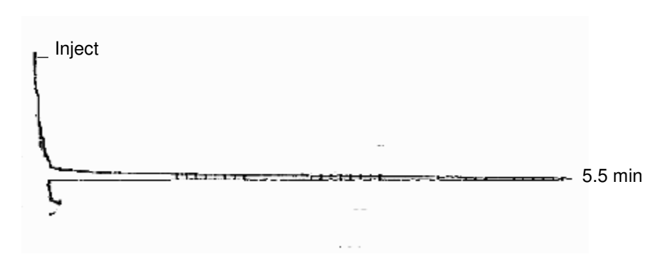
Figure 2. Chromatogram of Caprolactam