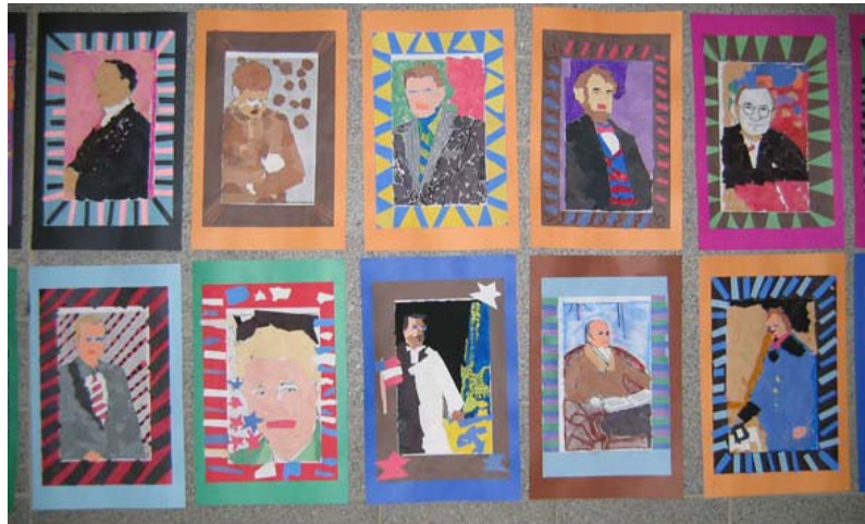
Student art work covers nearly all the available wall space.

Students in grades K-5 receive exposure to the four art disciplines: dance, drama, music, and the visual arts; those in grades 6-8 participate in a 30-week visual arts program with an artist in residence and also receive music instruction. The artist in residence program weaves arts learning with academic themes from social studies, history, and literature, each year focusing on a