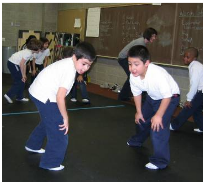
Dance classes also help students learn new vocabulary, such as locomotor.

A retired guidance counselor who was at Greeley for 34 years said, "We always had good kids and nice teachers. How you teach the kids in the beginning affects how they end up." Teachers agree that behavioral problems are rare, and their students are frequently complimented. "We don't have the discipline problems here," said a reading specialist. "We nurture them and have high expectations, and the kids know it." Staff members communicate those high expectations and increasing levels of responsibility "early and often." The former guidance counselor elaborates: Some schools think there's nothing you can do so they accept the behavior, but at Greeley the pre-K and Kindergarten teachers expect respect and demand a lot, so students learn that's what they have to do.