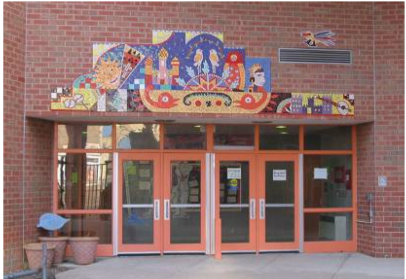
The Horace Greeley School announces its commitment to the arts and diversity from the first glimpse.

Student-designed murals celebrating literacy and cultural diversity alert visitors that there is something special about the school before they even enter its doors. Situated in a rapidly changing neighborhood in the north side of Chicago near Lake Michigan and Wrigley Field, the school is home to 450 students in grades pre-K to 8. Most students who attend Greeley are of Hispanic or Latino background, about one third are English language learners, and more than 90 percent receive free or reduced-price lunch. Half of the student population resides in the neighborhood; the rest are drawn to Greeley from all over Chicago.