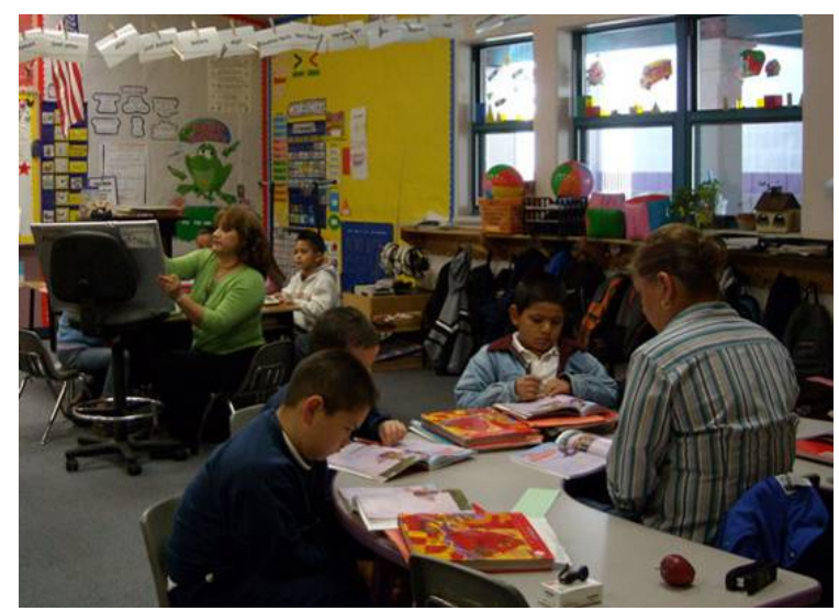
Student reading groups are flexible, changing daily, if necessary.

The targeted reading instruction or interventions are a source of pride to the entire staff and are credited with having a great deal to do with both the improvement in test scores and the improvement in reading skills of all students. The interventions are also credited in part with decreases in the numbers of 5th-grade students classified as LEP and increases in the numbers of students taking the AIMS test in English.