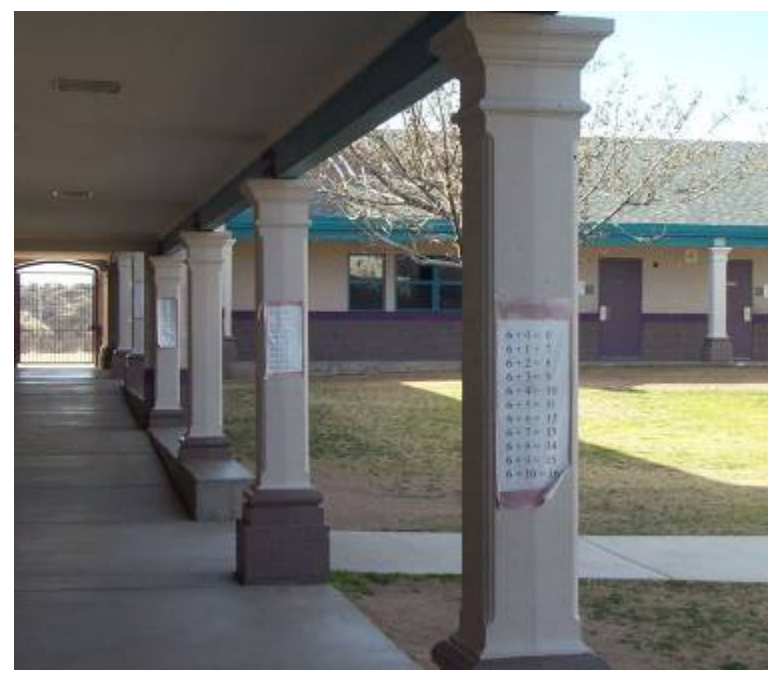
No opportunity to learn is wasted: Columns display math facts.

In the school's entrance, school photographs, awards, and trophies are prominently displayed in cases and on the walls. Striking in its seeming incongruity is a display, in various forms and media, of the school mascot, a dolphin. The dolphin