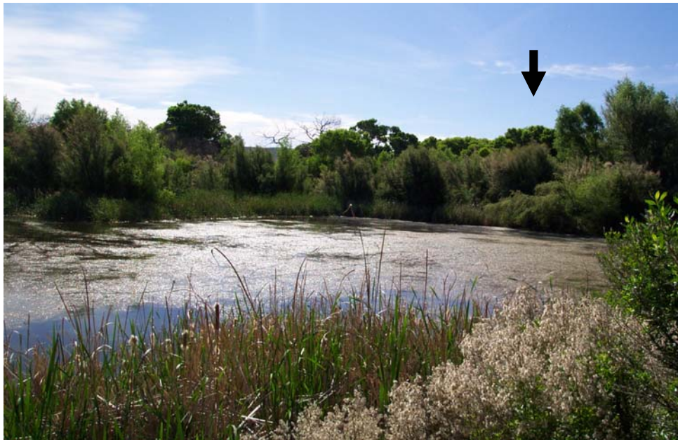
Figure 10. Exterior view (from the east) of Yellow-billed Cuckoo habitat along the agricultural fields in the western portion of the Spur Land and Cattle Company property. Approximate cuckoo detection locations are indicated by the arrows.