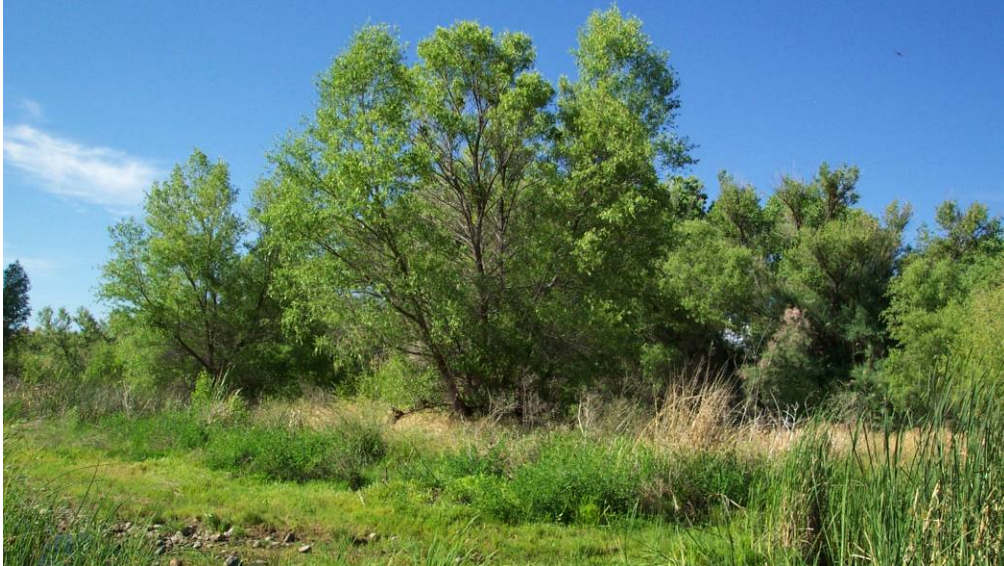
Figure 2. Habitat at location of probable migrant Willow Flycatcher at Detection site 2.

During the second survey, we detected the first probable territorial Willow Flycatcher on the SLCC parcel, in mixed willow-saltcedar habitat along the large pond located east of the river corridor (Figures 4 and 5). On the third survey visit (which occurred during the non-migrant period), this site hosted a singing male flycatcher and its mate, and we located an active flycatcher nest (Figures 6 and 7). This confirmed the presence of breeding Southwestern Willow Flycatchers on the SLCC property.