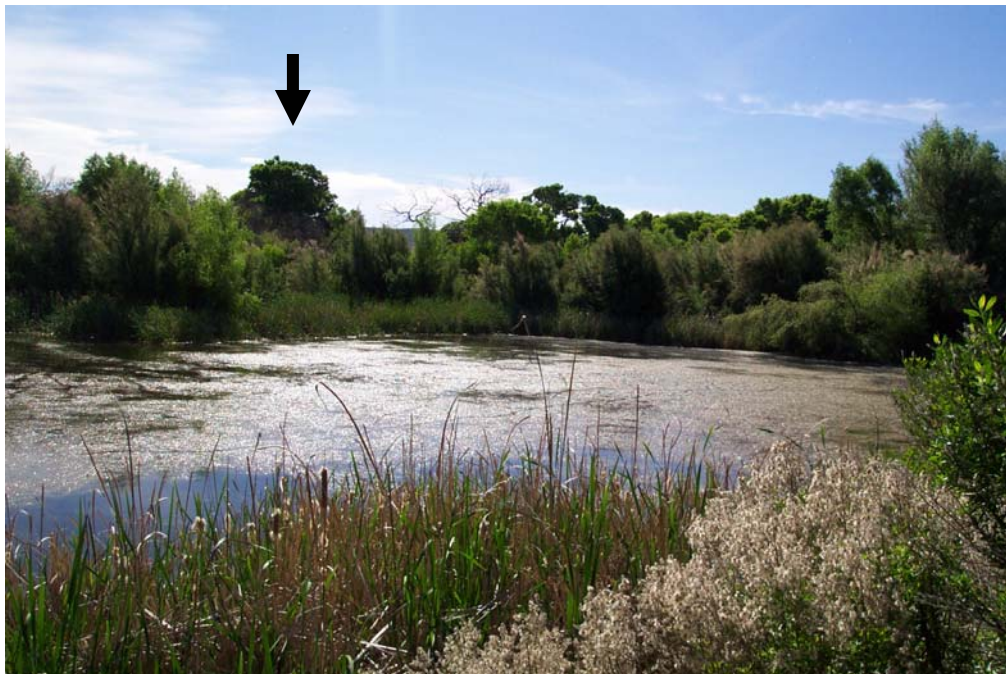
Figure 5. Interior view of the habitat in the Southwestern Willow Flycatcher breeding territory (Detection site 3).