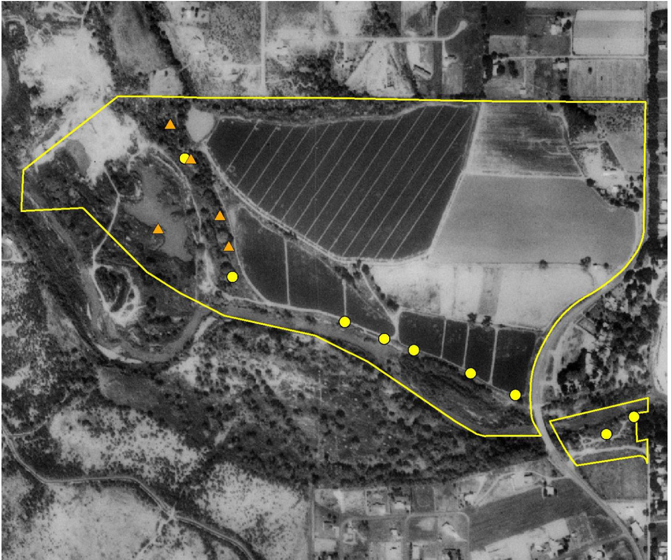
Figure 8. Aerial photograph showing the location of all Yellow-billed Cuckoo survey sites (filled circles) and estimated cuckoo detection locations (filled triangles). Boundaries of the Spur Land and Cattle Company parcels are outlined in yellow.