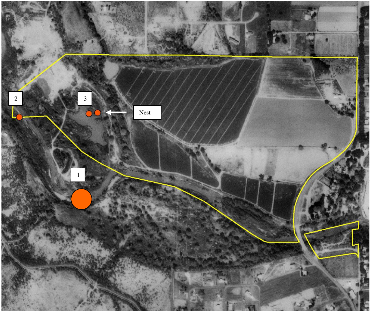
Figure 3. Aerial photograph showing location of all Willow Flycatcher detection site coordinates (filled circles). Note that the location of Detection site 1 was approximated based on remote observation. Boundaries of the Spur Land and Cattle Company parcels are outlined in yellow.