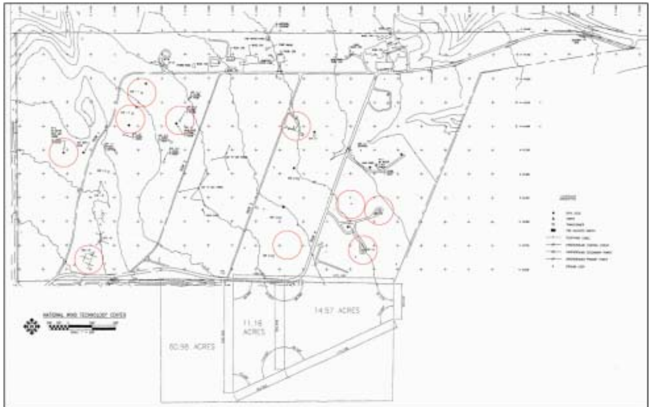
Figure I-3. Location of carcass search plots on the NWTC.

observer then walked each plot once every 2 weeks for the 12-month duration of the project, noting the date, location, and identity of any carcass found (Savereno et al. 1996).