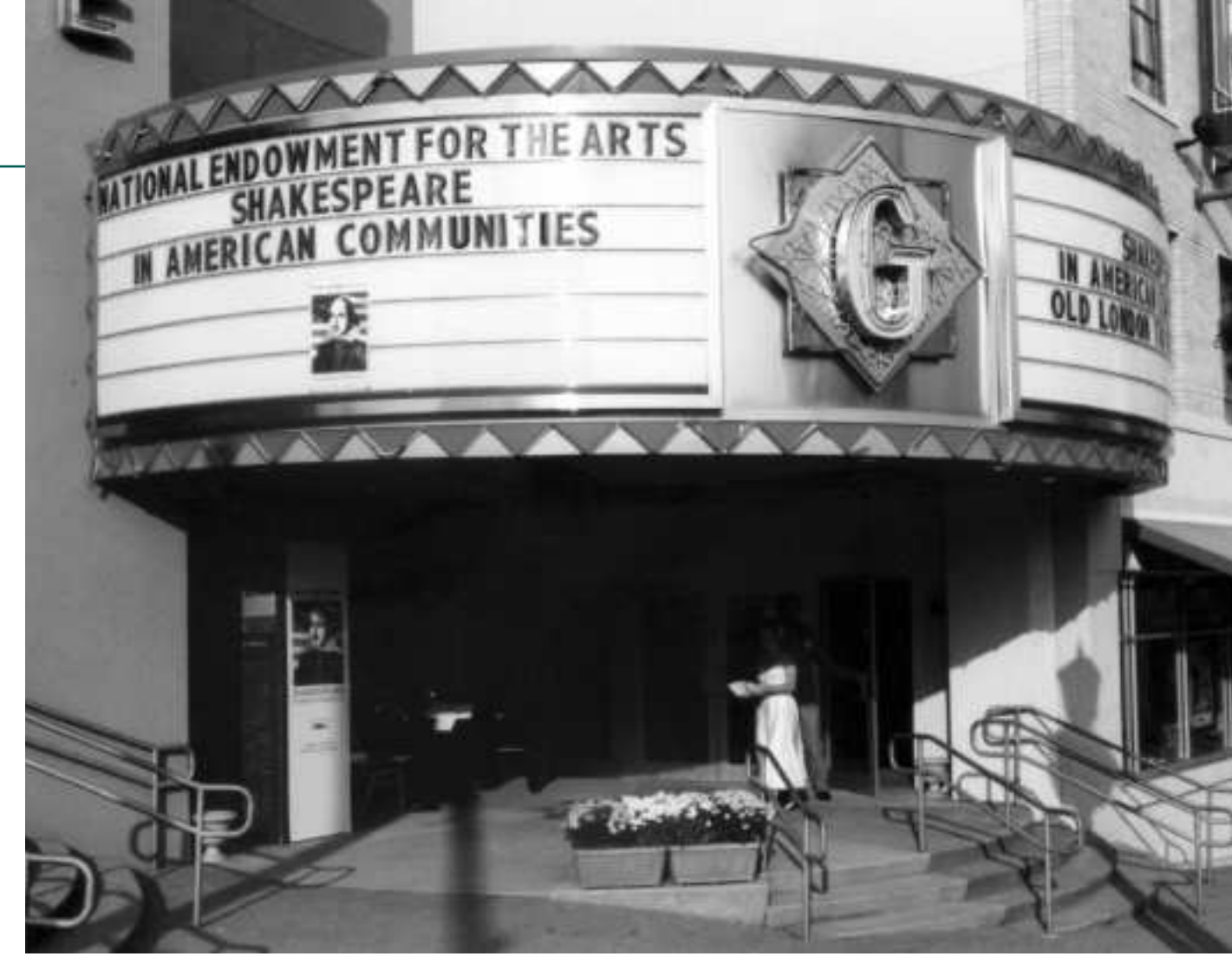
Opening night for the Shakespeare in American Communities initiative in New London, Connecticut in September 2003.