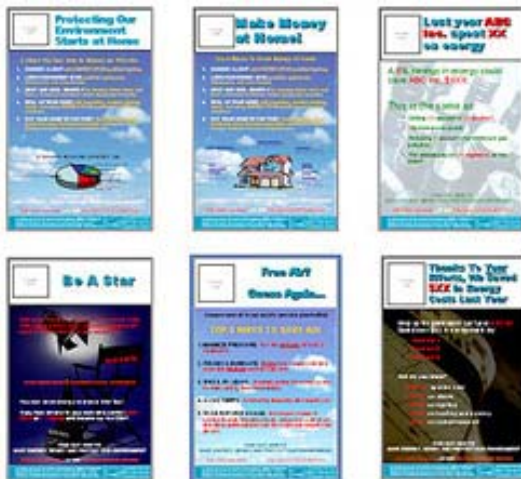
Employee Awareness Posters