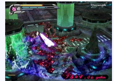
Nanobreaker for PS2