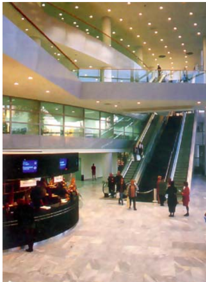
Foyer Congress Center Messe Frankfurt