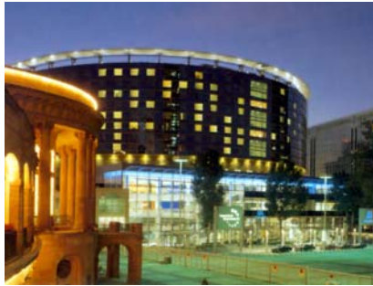
Maritim hotel (reception 21.4.04 evening)