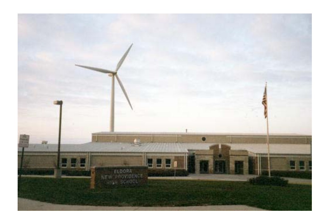
FIGURE 4: FUNDED THROUGH A SEP, A SCHOOL'S ELECTRICITY NEEDS COULD BE OFFSET BY INSTALLING A WIND TURBINE. THE WIND TURBINE COULD ALSO BE USED AS AN EDUCATIONAL TOOL IN THE SCHOOL'S CURRICULUM.