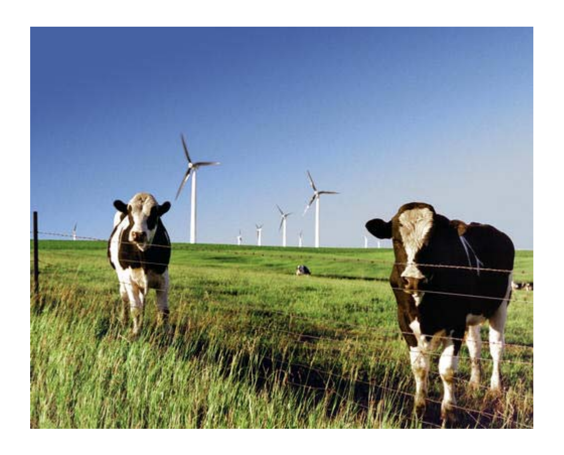
FIGURE 3: A WIND DEVELOPMENT SUPPORTED BY SEP FUNDS MAY RESULT IN THE RETENTION OF MONEY IN LOCAL ECONOMIES AND CAN BE PARTICULARLY HELPFUL IN SUPPORTING RURAL ECONOMIC DEVELOPMENT.