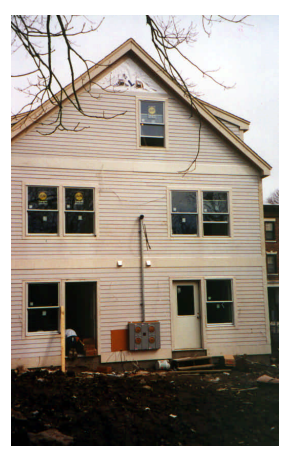
Erie Ellington's buildings were designed to be energy efficient and match the architectural style of neighboring