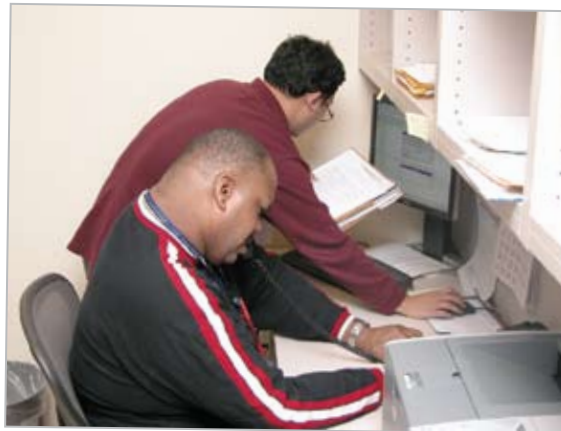
USCIS transitions from paper-based system to electronic environment

The Transformation Program Office has taken the first steps in leading USCIS into a secure digital environment, providing enhanced customer service and offering new opportunities for our employees. These improvements will not only result in better service for more customers, but will also serve to enhance security, deter immigration fraud and improve efficiency.