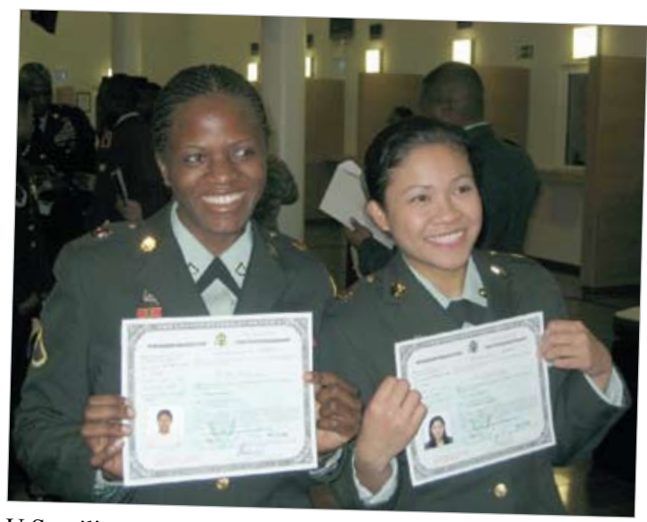
U.S. military naturalization ceremony, Fort Bliss, TX

The Policy Coordination and Special Programs Branch is responsible for developing and managing programs, regulations, products, policies and coordinating activities related to Employment Authorization and Advance Parole, Fee Waivers, Requests for Evidence and acts as the general liaison with the Office of the USCIS Executive Secretariat, the USCIS Office of Chief Counsel, Department of Homeland Security headquarters and other department entities.