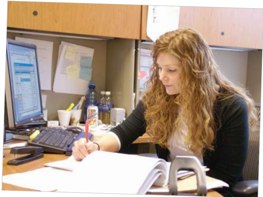
USCIS employee reviews work product

The Resource Coordination Branch is responsible for overseeing and monitoring the formulation and development of the Domestic Operations budget, which in FY2007 totaled more than $420 million. This branch is also responsible for coordinating the development of the Advance Acquisition Plans for each domestic operations headquarters' operating unit; monitoring and assisting the contracting officer representatives with performance of contract administration duties and assisting and providing oversight of all personnel alignments throughout headquarters and the field. In FY2007, the Resource Coordination Branch played a pivotal role in administering the reorganization of the Domestic Operations field office command and control structure. The realignment was successfully implemented with little or no operational disruption and the four-region structure is firmly engrained within the USCIS Domestic Operations Directorate organization structure.