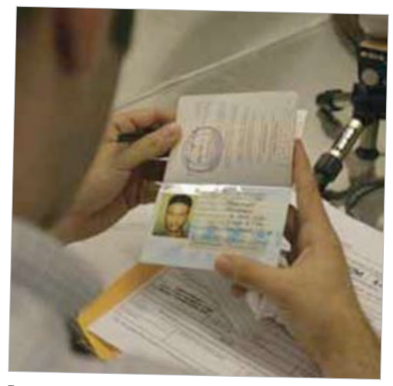
Integrated Document Production Branch supports USCIS' mission of developing secure documents

USCIS identity cards that integrate biometric and biographic information. As a result, IDP has become the world leader in the personalization of secure identity cards using optical memory technology. Specifically, the branch personalizes Permanent Resident Cards, Employment Authorization Documents, Re-entry Permits, Refugee Travel Documents, USCIS Employee Credentials and Laser Visas/Border Crossing Cards for Department of State and Transportation Worker Identification Credentials for Transportation Security Administration.