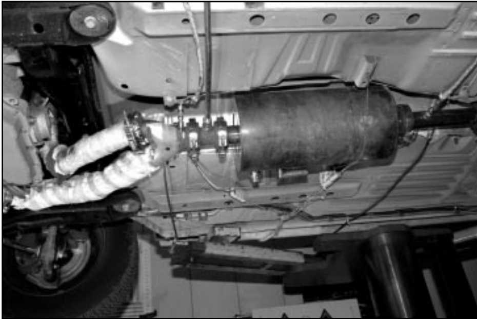
NREL/Benteler prototype VCI catalytic converter mounted on a Ford Taurus for emissions tests at the Southwest Research Institute. After sitting cold for 24 hours, hydrocarbon emissions were 84% less and carbon monoxide emissions 91% less than with the car's conventional converter under a standard testing cycle.