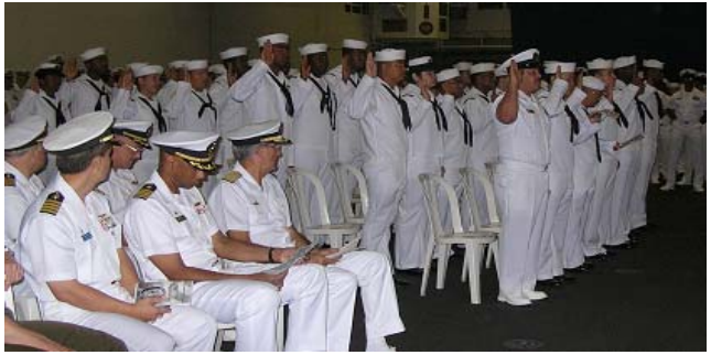
USS Kearsarge sailors taking the Oath of Allegiance