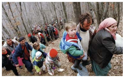
Kosovar Refugees on the Albanian border

In FY06, the President has proposed admitting 70,000 refugees. With the new Refugee Corps in place, USCIS is prepared to fulfill this important humanitarian commitment.