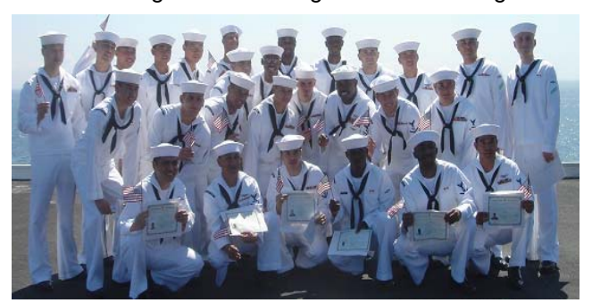
USS Kitty Hawk sailors celebrating their Citizenship

After arriving on the USS Kitty Hawk and USS Kearsarge, U.S. Navy Legal Affairs and Public Affairs offices provided the USCIS Naturalization teams with bunk beds in temporary quarters. With important work to complete before the ceremony, the USCIS team was also provided with a desk and materials within the ship's tight public affairs office aboard the Kitty Hawk. Several public announcements were made on the ships to let all hands know that USCIS officers were aboard and available to answer immigration questions, and question and answer sessions were held for sailors with concerns about naturalization, adoption, marriage and the like.