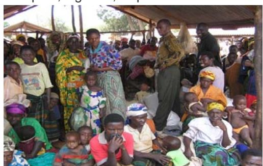
Burundian refugees, Lukole Refugee Camp, western Tanzania