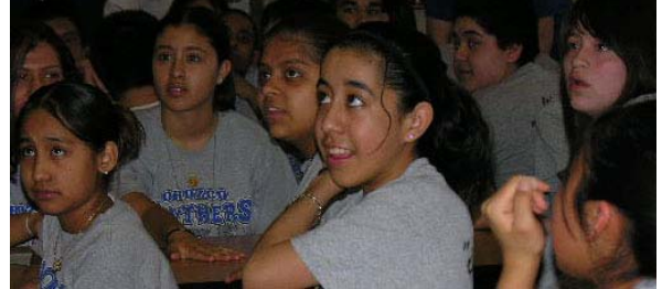
Students participated in a mock Citizenship Interview and answered Civics Exam Questions