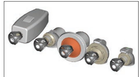
Concept illustration of advanced drivetrains.

Under its subcontract, Northern Power Systems developed a direct-drive (no gearbox) permanent magnet generator because the Phase I study showed that this configuration had the greatest potential to decrease the cost of energy. Permanent magnets provided increased efficiency and allowed this 1.5-MW generator, with a rotational speed of just 19.65 rpm, to be no larger than 4.0 m in diameter. The generator design was based on design concepts developed by General Dynamics Electric Boat Division for ship propulsion systems. Additional details of these designs can be found in the Northern Power Systems WindPACT Drivetrain Alternative Design Study Report. This design is awaiting a test slot in the National Wind Technology Center dynamometer. As part of this program, Northern Power also designed and fabricated a full-power converter that will allow variable-speed operation of the WindPACT drivetrain. The converter features state-of-the-art controls and can address the ride-through requirements of the EON Specification. Northern Power is now developing a next-generation advanced power converter under a Low Wind Speed Technology Phase I project.