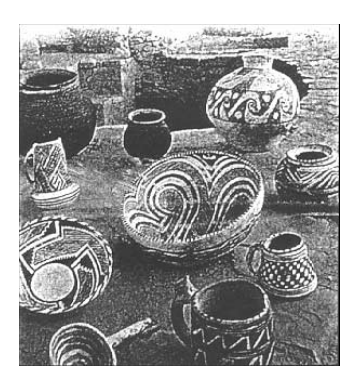
The sturdy baskets, woven sandals, and beautiful pottery left behind by the Anasazi may be 1,000 years old.

As the population grew, more land on the mesa top had to be farmed in order to feed the people. That meant that trees had to be cut to clear the land and also to use for houses and fuel. Without the forests, the rain began to wash away the mesa top.