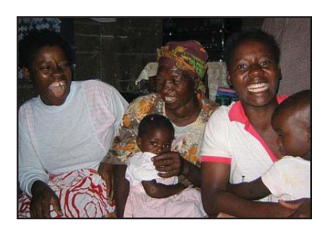
Grace took action to prevent the spread of HIV from mother to child.