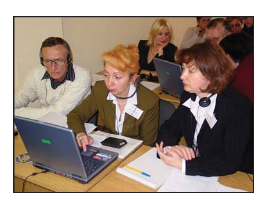
Russian Regional Medical Personnel attend a training on the Resource Needs Model.

With Emergency Plan support, the Healthy Russia 2020 Project trained Russian governmental and non-governmental organization representatives to use the Resource Needs Model to evaluate the cost-effectiveness of and resource distribution among HIV/AIDS interventions. HIV/AIDS stakeholders use the model in regional and municipal HIV/AIDS budget planning. For example, in Irkutsk, Orenburg and Ivanovo, regional planners evaluated the use of financial resources for HIV/AIDS programs. The results of the analysis led these planners to increase spending for prevention efforts. In Orenburg, the Government also decided to increase its overall funding levels for HIV/AIDS programs. The Resource Needs Model also served as the foundation for a four-year, $7.5 million budget for special HIV/AIDS programs and events. This new way of analyzing HIV/AIDS programs represents a sea of change in the attitudes of regional decision-makers toward the fight against HIV/AIDS.