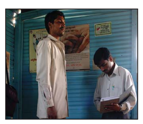
A community health worker provides home-based care to a client.

The Emergency Plan assists efforts to pioneer a new comprehensive care model, through which people living with HIV/AIDS and their families are provided with improved health care, prevention services, and psychosocial and economic support. Since the project began in 2001, it has registered 6,028 people living with HIV/AIDS, of whom 513 are children, with the goal of improving the quality of life for these individuals and their families. Reaching into the community, the project has established and trained a cadre of community members, many of whom are HIV-positive themselves, to serve as "peer" community health workers. Community health workers provide critical information on counseling, treatment of opportunistic infections, and antiretroviral treatment. This program highlights the important role that trained community health workers play in HIV prevention and care for people living with HIV/AIDS.