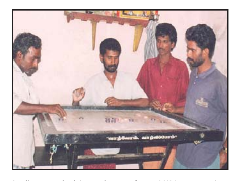
Indian truck drivers learn about HIV prevention at social centers.