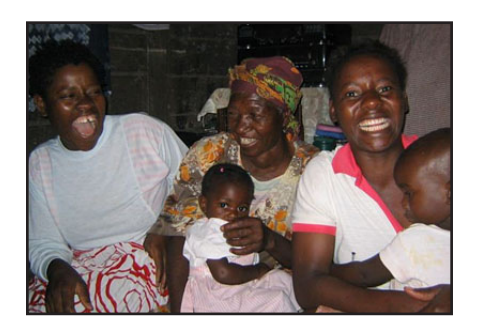
Grace took action to prevent the spread of HIV from mother to child.