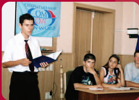
Forum attendees listen as students from the cities of Novoaltaysk and Aleysk debate whether youth parliaments serve a useful role as local advisory bodies.