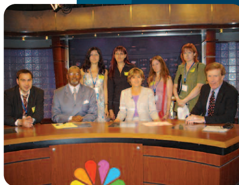
Lithuanian journalists visit the studio of NBC's Washington, D.C. affiliate, WRC-TV, for a behind-the-scenes look at the evening news team at work.