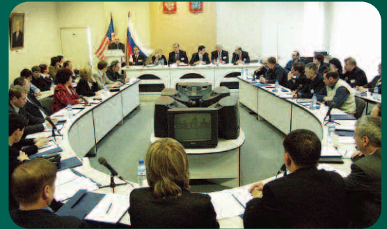
Open World alumni and U.S. host judges gather at the Sokol conference center in Saratov for April's rule of law conference.