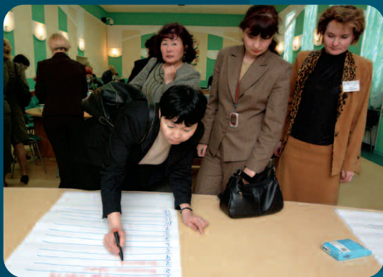
Conference attendees sign up for a breakout session on socially responsible businesses.