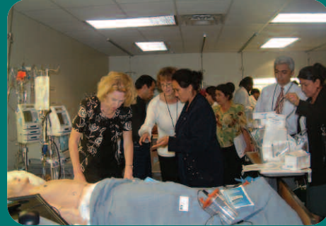
Uzbek health delegates take turns working with a patient simulator during their visit to the Clinical Assessment Suite at the University of South Florida Health Sciences Center, their host organization in Tampa.