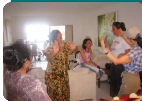
Uzbek health practitioners teach traditional dance steps to their Tampa hosts during the delegation's farewell celebration.

Health professionals explored rural health care delivery at a community/migrant health center outside Tampa; attended a community health fair staffed by medical-student volunteers; participated in a panel discussion with Hillsborough County officials on the county's nationally recognized managed care plan for uninsured indigent residents; learned how Community Health Workers (CHWs) provide health education to hard-to-reach populations. (Hosts: AIHA/University of South Florida Health Sciences Center.)