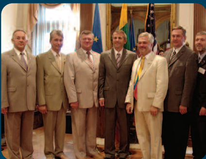
Ambassador Vygaudas Usackas (center) joins Lithuanian municipal executives participating in Open World during one of the receptions he hosted for program delegates at his embassy in Washington, D.C., in 2004.

Open World's newest program received high marks from the 100 Lithuanians who participated. Higher education, lobbying, business associations, health care, Social Security, and citizen participation in local government were rated among the most useful topics studied. In a representative comment, a leading rural development consultant said of his environmental visit to Middlebury, Vermont, "Local grassroots [environmental] initiatives really left a big impression on me. I have both learned how to better communicate with city and village communities and realized the need to consult with them more regularly on policy issues."