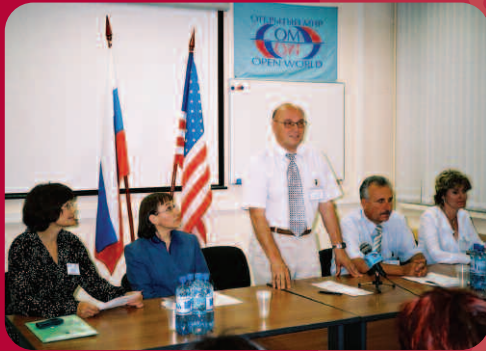
Barnaul Deputy Mayor Nikolay P. Cherepanov (standing) opens the conference with a commitment to meeting the needs of the region's youth.