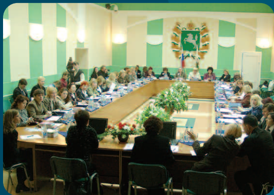
Open World alumni gather in the Tom Conference Center outside Tomsk for the opening session of February's conference on women's leadership.