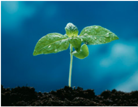
With new technology, researchers hope to save vast quantities of time, money and water by having plants "tell" farmers what they need and when.