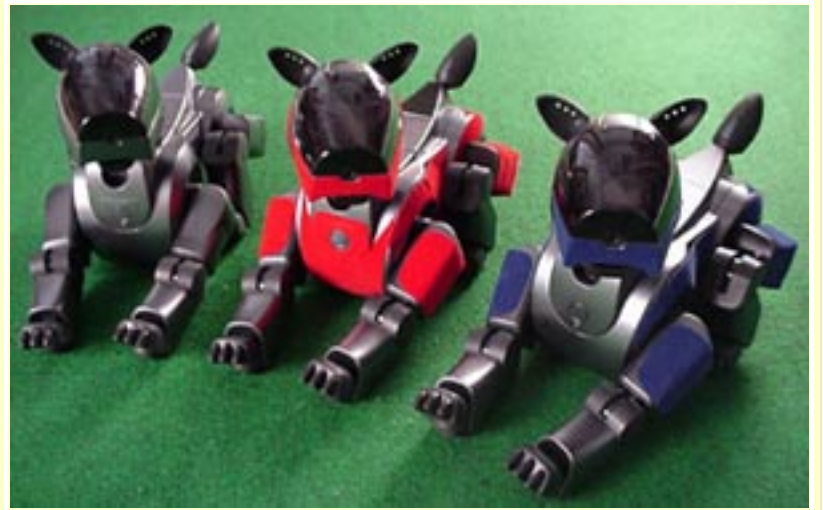
Members of the Carnegie Mellon Sony 4-legged-robot RoboCup team, CMPack'02, which won first place at RoboCup 2002 in Fukuoka, Japan.

See the RoboCup Web site for more information on the competition. More information on the CMU team is available on the CMU CORAL site .