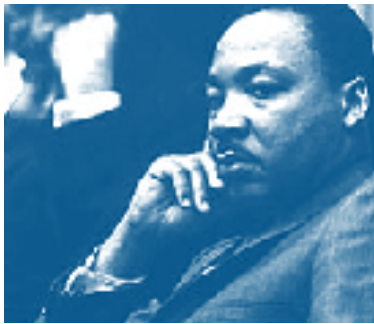
The civil rights leader Martin Luther King, Jr.

of the civil rights movement of the 1950s and 1960s. Because of this movement, civil rights laws that protected voting rights and ended segregation were passed. King believed in the ideals of the Declaration of Independence. He advanced the idea that every citizen deserves America's promise of equality and justice.