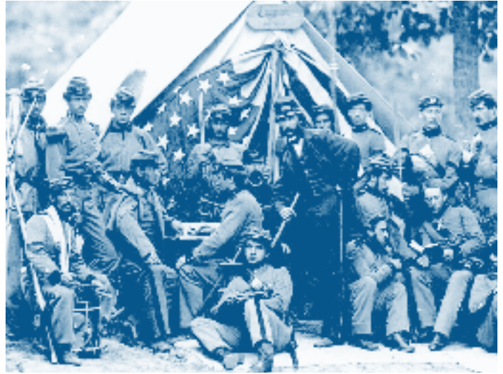
Civil War Engineers in the Union Army

Douglas. These took place when Lincoln and Douglas ran against each other for Illinois' U.S. Senate seat in 1858.