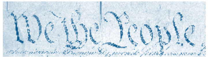
The Preamble of the Constitution

The preamble says: “ We the People of the United States, in Order to form a more perfect Union, establish Justice, insure domestic Tranquility, provide for the common defense, promote the general Welfare, and secure the Blessings of Liberty to ourselves and our Posterity, do ordain and establish this Constitution for the United States of America.” This means that our government has been set up by the people, so that it can be responsive to them and protect their rights. All power to govern comes from the people, who are the highest power. This idea is known as popular sovereignty.