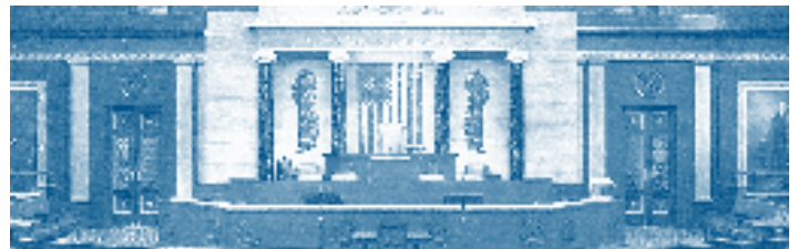
The U.S. House of Representatives in Washington, DC

The House has had 435 members since 1912. Since that year, however, the distribution among the states of those 435 members has changed. This is because the number of Representatives from each state is re-calculated every ten years. New information from the Census is used in this re-calculation. If one state gains many residents while another state loses many, the first state could get one or more new Representatives, while the other state could lose one or more. But the overall number of U.S. Representatives does not change.