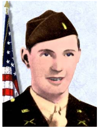
Rank and organization: Second Lieutenant, U.S. Army 15th Infantry Battalion, 3d Infantry Division