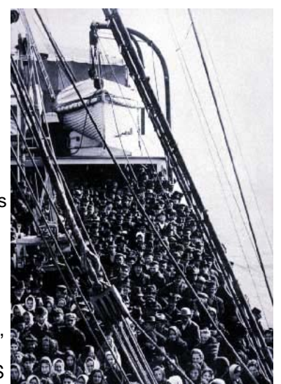
Immigrants arriving by ship, 1912

While most historical immigration records are open to the public at the <u>National Archives</u>, more recent records remain with DHS and are subject to the FOIA process. For more information, visit <u>USCIS History, Genealogy and Education</u>. Check future issues of USCIS Today regarding new USCIS programs to assist the public with genealogical research.