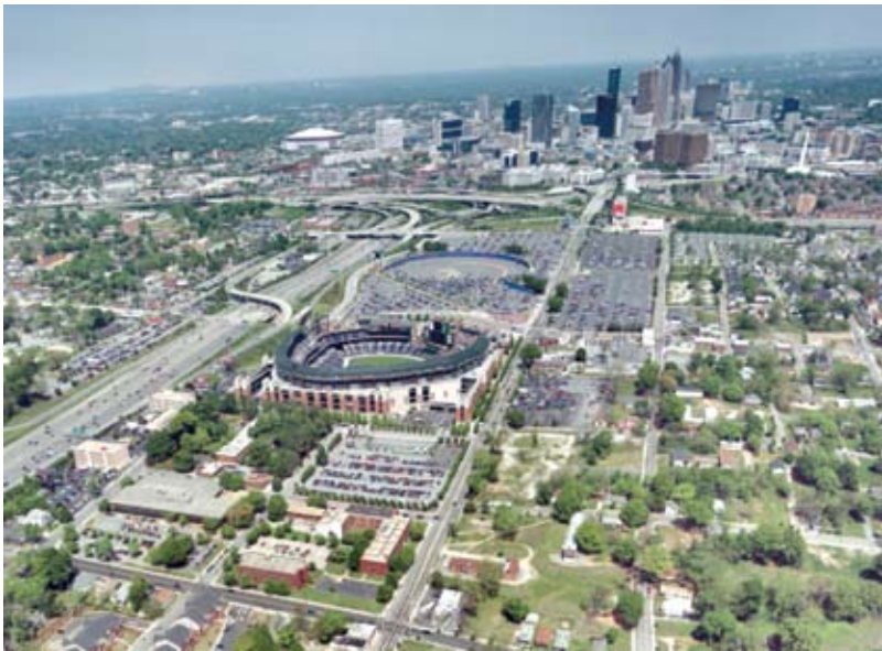
Aerial view of downtown Atlanta, including Turner Field.

Working through this process with the FHWA has not only helped GDOT fine-tune its LCCA application but also improve its working relationship with FHWA. That, in turn, led to the two agencies coming together in May 2006 for a frank discussion of what the GDOT is looking for in terms of LCCA software. As a result of those conversations, the next release of RealCost will include some of the very features that GDOT has requested.