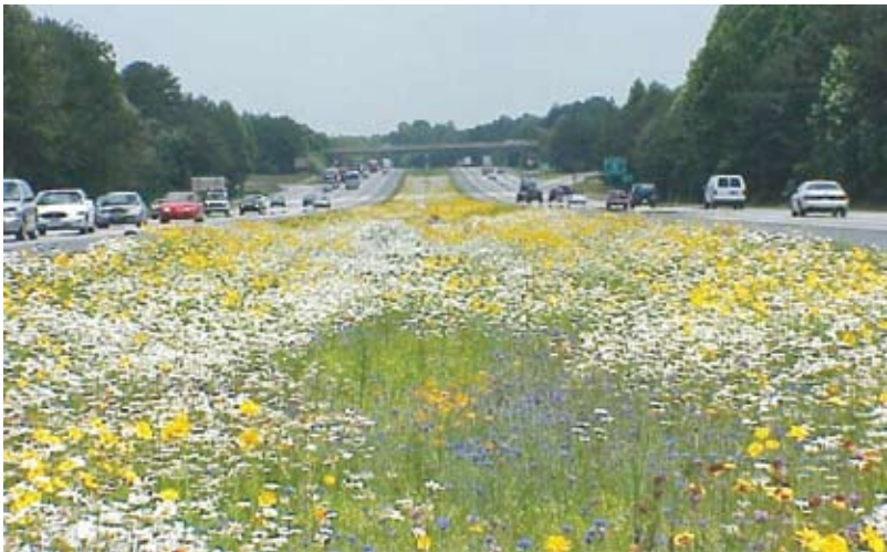
Wildflowers along I-75 in Bartow County.