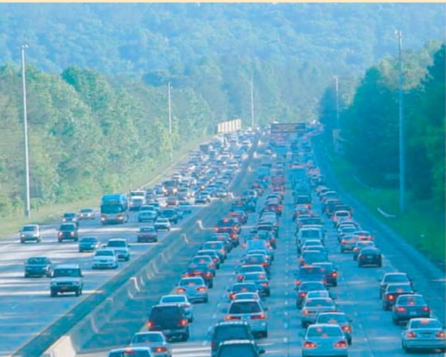
Rush-hour traffic on Georgia 400.

For each case study, FHWA representatives interview State transportation staff and compile the information, and the State approves the resulting material. Thus, the case study reports rely on the agencies' own assessment of their experience. Readers should note that the reported results may not be reproducible in other organizations. ■