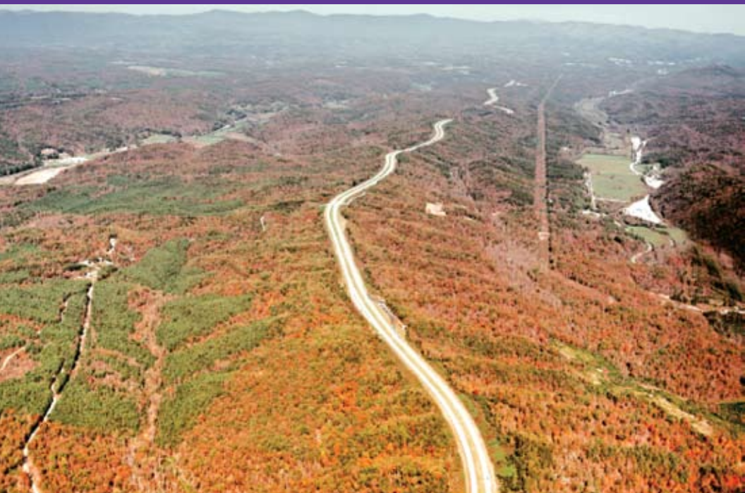
A ridge route in rural Georgia.